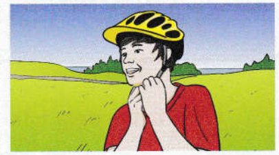
6. put on